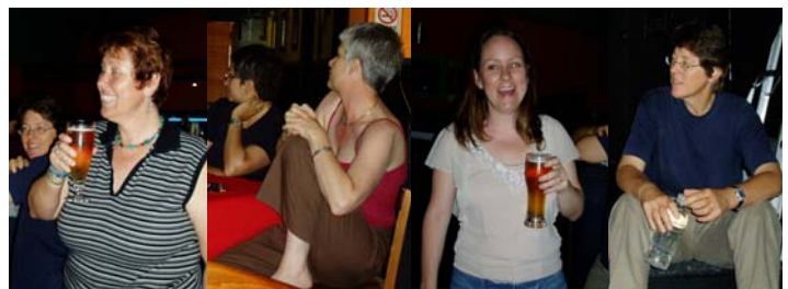
Some of us didn't...