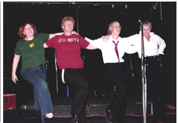
and others to take advantage of the pub and become rather jolly as a result.