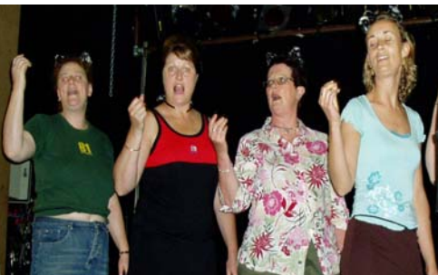
Dog's Breakfast created a stir which had everyone wildly wondering what on earth had possessed them when they suddenly demanded money for their performance. They were placated however, with promises of free bowls of milk for their pussies.