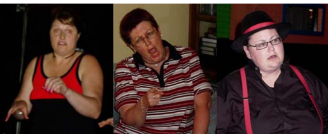
Some of us stressed...